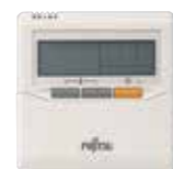
Wired Remote Controller