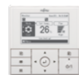
Wired Remote Controller (High grade)